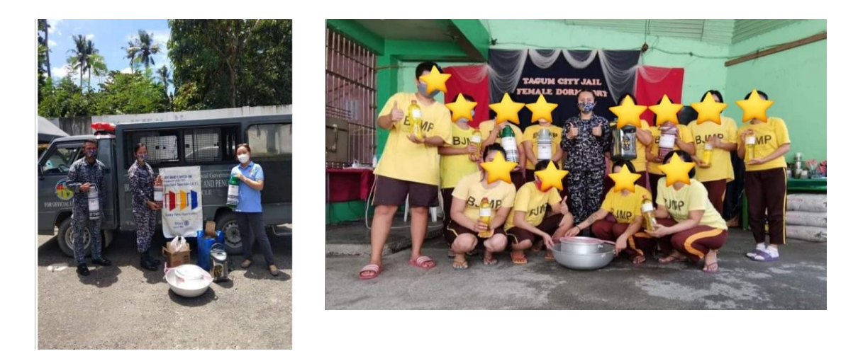
Turn-over of kitchen tools/utensils, thermos and dishwashing liquid to Tagum City Female Jail 05 August 2020